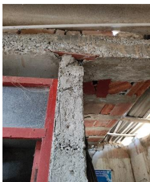
Figure 2. Concrete Spalling – House N°12

According to the American Concrete Institute (ACI), it defines a crawl space as an empty space that is present in the concrete, either due to the construction process, inadequate mix design or poor gradation of materials [2] (Figure 2).