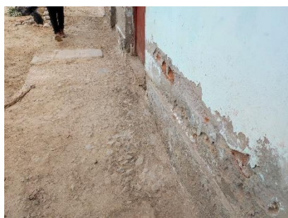
Figure 3. Efflorescence in walls – House N° 06

This pathology is one of the most common in dwellings, due to the area in which they are located, or the humidity that concentrates in them. The ACI explains it as an accumulation of whitish salts, which originates in the superficial part of the constructive element (Figure 3), either in walls or concrete structures, and precipitates by the action of evaporation [2].