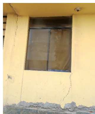
Figure 5. Cracks in walls - House N° 06

These are openings with a separation greater than 1 mm (Figure 4). Compared to the crack, this affects the structure in its entire width and can affect the seismic response capacity of any construction element [3].