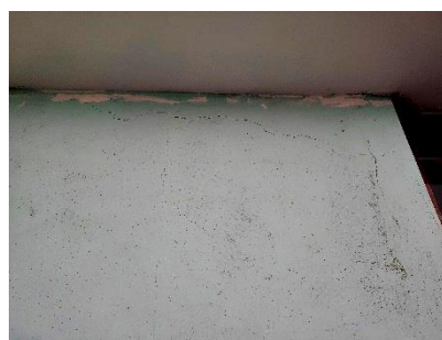
Figure 4. Fissures in walls - House N°10

They are elongated openings, with a separation of up to 1 mm, which only affect the superficial part of the construction element (Figure 3). Their presence is caused by temperature changes, inefficient load distribution, soil movements and tension between its reinforcements [3].